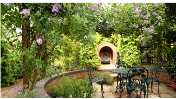
"natural planting with lots of flowers can take lots of planning but for this client it was well worth it"