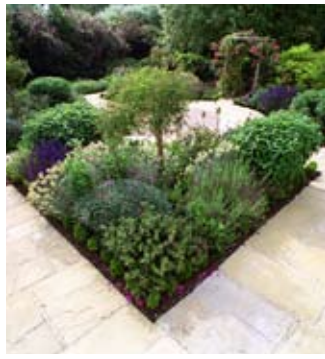
"careful designing has allowed for lots of flowers in this smaller town garden"

Herbaceous perennials are such good value that I do like to create a place near the house for them, often surrounding the terrace where the colour and scent can be enjoyed at every opportunity. With careful planning and some general maintenance herbaceous perennials come back bigger and stronger every year with a stunning flower display from May to September.